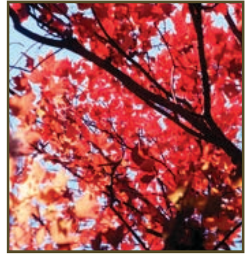
Trees showing fall colors.