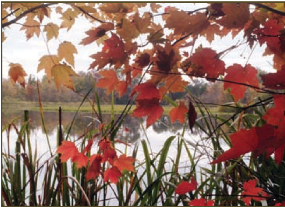
Fall Leaves.