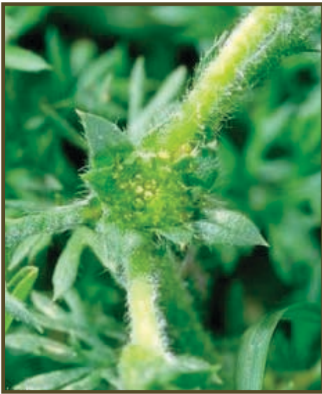
Lawn burweed spines

For season-long weed control, and based on the product's label, a second application may be required about nine weeks after the initial application. To activate some products, irrigation or rain may be necessary following application. Because many preemergence products interfere with lawn seed germination, delay over-seeding with ryegrass six to sixteen weeks after application.