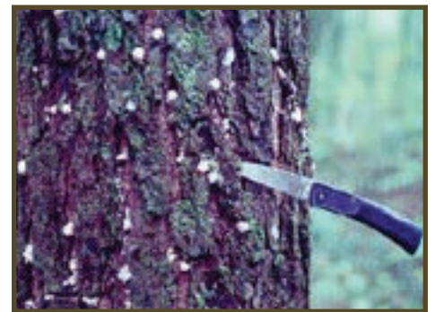
Pitch tubes of the southern pine beetle (SPB), Dendroctonus frontalis Zimmermann, on outer bark.