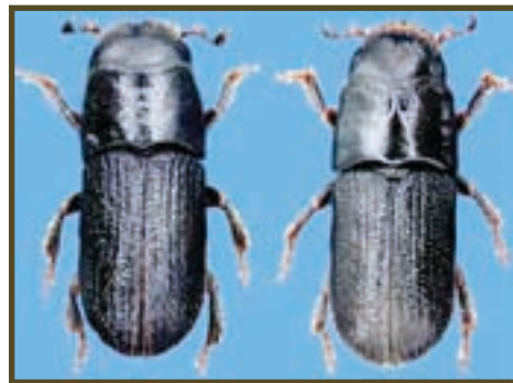
Dorsal view of southern pine beetles, Dendroctonus frontalis Zimmermann, with male on the left and female on the right.

If you suspect you have pine beetles you can also cut back the bark and look for the trails or tunnels left by the beetle in the cambium layer.